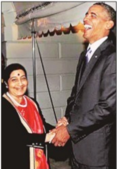
With former US President Barack Obama . File

Gifted with oratory skills, both in chaste Hindi and English, she made life easy for Indian diplomats prepping for visits. “Remembering our 2 AM session with #SushmaSwaraj in Abu Dhabi on March 1. She was to