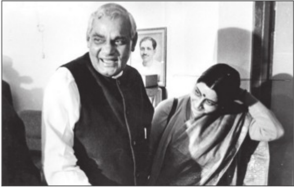
(Clockwise from top) Sushma Swaraj; with BJP leader Murli Manohar Joshi; with L K Advani; and former Prime Minister Atal Bihari Vajpayee.