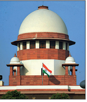
NO END TO LEGAL TANGLE?

A bench of CJI Ranjan Gogoi and Justices S.A. Bobde, D.Y. Chandrachud, Ashok Bhushan and S. Abdul Nazeer had decided to commence day-to-day hearing on the appeals after a mediation panel, appointed by it and comprising ex-SC judge F.M.I. Kalifulla, renowned mediator Sriram Panchu and spiritual leader Sri Sri Ravishankar, reported to the SC after 155 days of negotiations that it was unable to bring hardliners, including Jamiat Ulema-i-Hind and VHP-backed Ram Janmabhoomi Nyas, to the negotiating table. Before reporting failure, the panel was close to success with most stakeholders, barring a few, in favour of its proposals such as Muslims giving up their claim on the site where Hindus want to build a Ram temple, Mus-