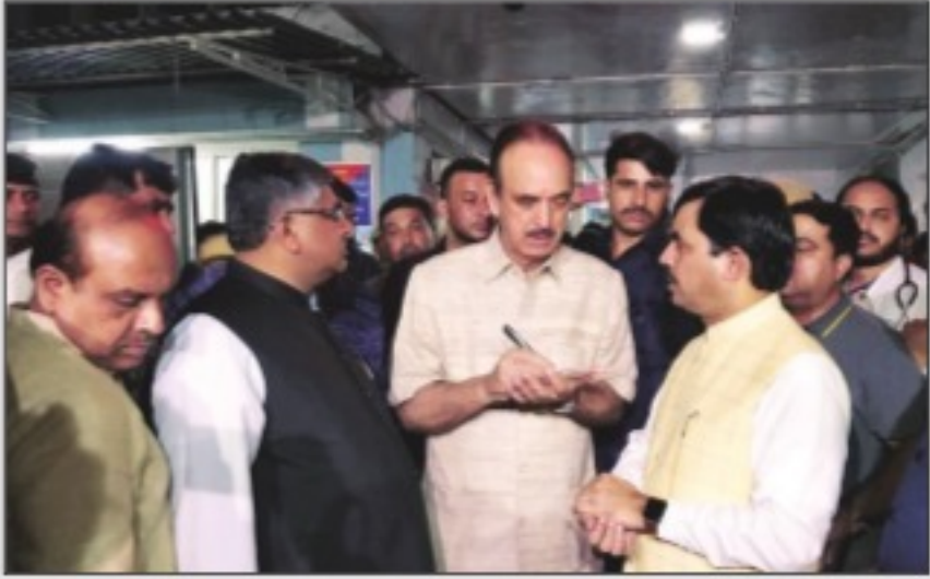
Union Minister Ravi Shankar Prasad, Congress MP Ghulam Nabi Azad and BJP leader Shahnawaz Hussain outside AIIMS on Tuesday.

A glorious chapter in Indian politics comes to an end. India grieves the demise of a remarkable leader who devoted her life to public service and bettering lives of the poor. Sushma Swaraj ji was one of her kind, who was a source of inspiration for crores of people.